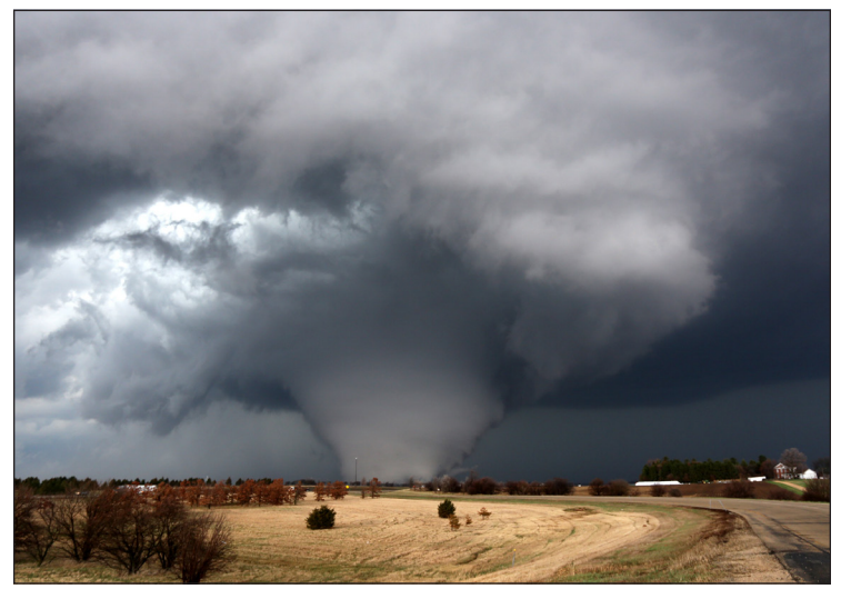
View of the Fairdale, IL "wedge" tornado from Interstate 39.

nimbus tower explode upwards into the atmosphere just north of Interstate 88 in central northern Illinois. The Fairdale tornado would form from this less than 30 minutes later, shortly after 6:30PM.