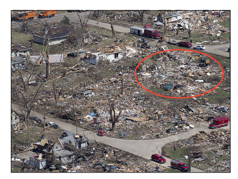
The path of destruction. An aerial shot of Fairdale after the tornado, the original location of Clem's house is circled.

At about 2PM CDT during the real-time AOS 453 lab, we began to track a line of severe thunderstorms that formed in eastern Iowa and began moving east toward the Mississippi river. A combination of wind shear (large speed and directional changes in wind with height), instability (created by warm moist air trapped below air that rapidly cools with height) and a forcing mechanism