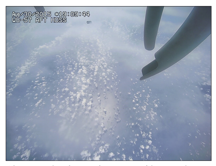
This is a rare photo from rear facing camera of the WB 57, during a mission into Erika, where the camera unbelievably caught the sonde in the air, just after it was released and moving away from the plane.

was rewarded with 1 minor and 2 major hurricanes late in the season, beginning with Marty, then Joaquin and finally Patricia which was the most intense tropical cyclone ever recorded in any