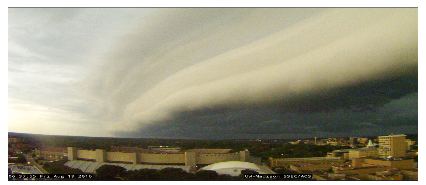
A thunderstorm gust front overtakes UW-Madison on August 19, 2016, as seen by the AOSS Rooftop Cameras.

See "Rooftop Cameras" continued on p. 11