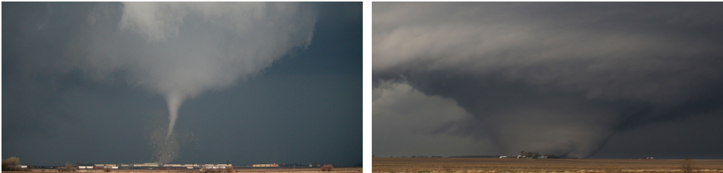
The 2015 Fairdale, IL EF4 tornado. The story can be found on page 9.