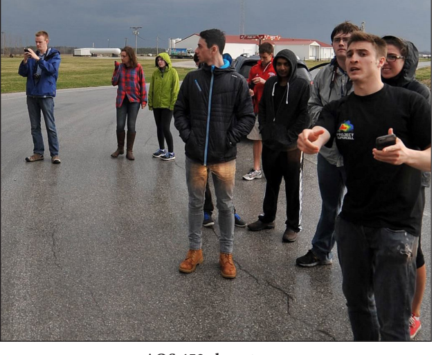
AOS 453 chase team.