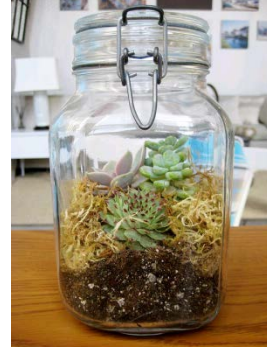
Figure 1. Sealed terrarium

The sealed terrarium in Figure 1 is an example of a physical system. The glass jar represents the boundary separating the system from its external environment. The air-tight terrarium can be described as a closed system because it does not exchange matter with its surroundings. However, it does exchange radiant energy with the environment (i.e., sunlight comes in and heat energy goes out). Our Earth exhibits similar system characteristics.