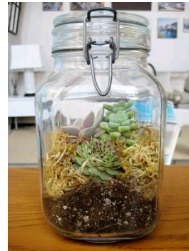
Figure 1. Sealed terrarium

The sealed terrarium in Figure 1 is an example of a physical system. The glass jar represents the boundary separating the system from its external environment. The air-tight terrarium can be described as a closed system because it does not exchange matter with its surroundings. However, it does exchange radiant energy with the environment (i.e., sunlight comes in and heat energy goes out). Our Earth exhibits similar system characteristics.